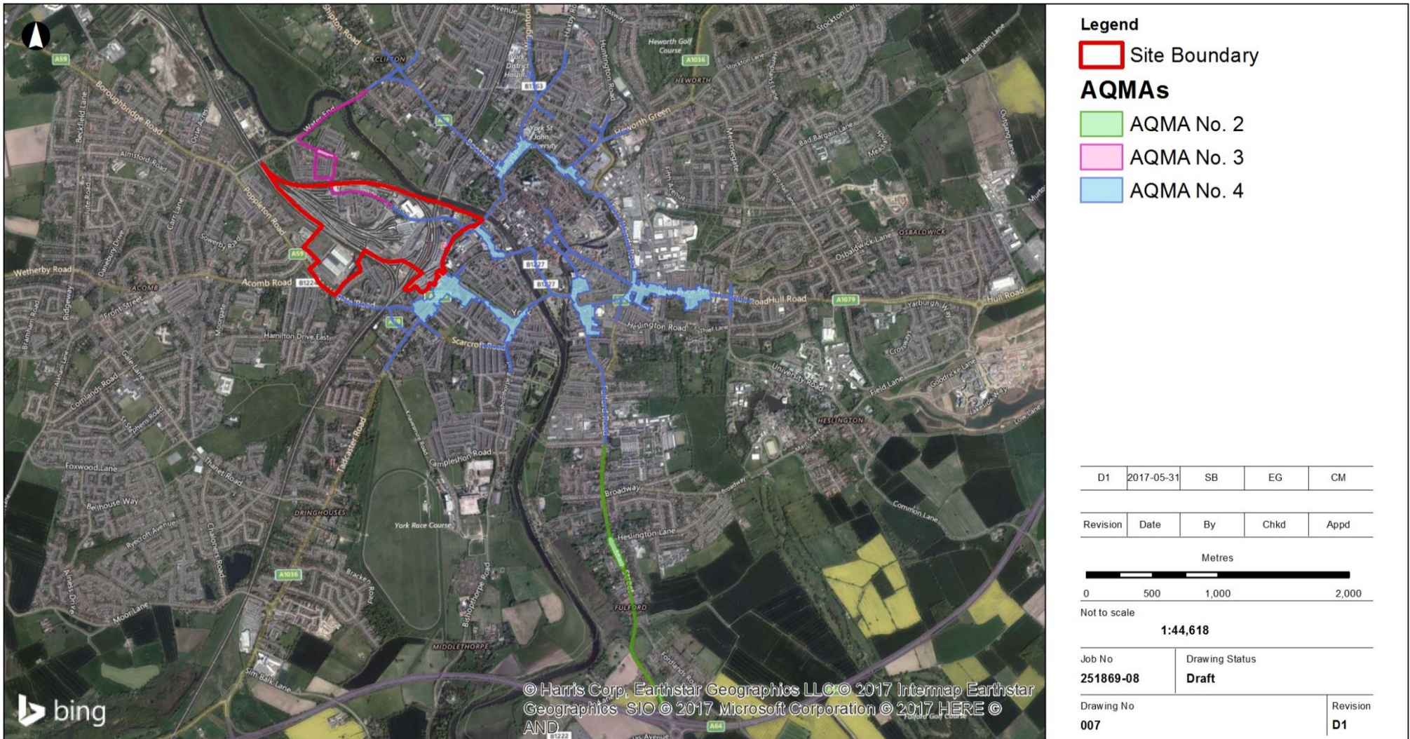
Figure E5: The three AQMAs in place for York and in proximity to the York Central site