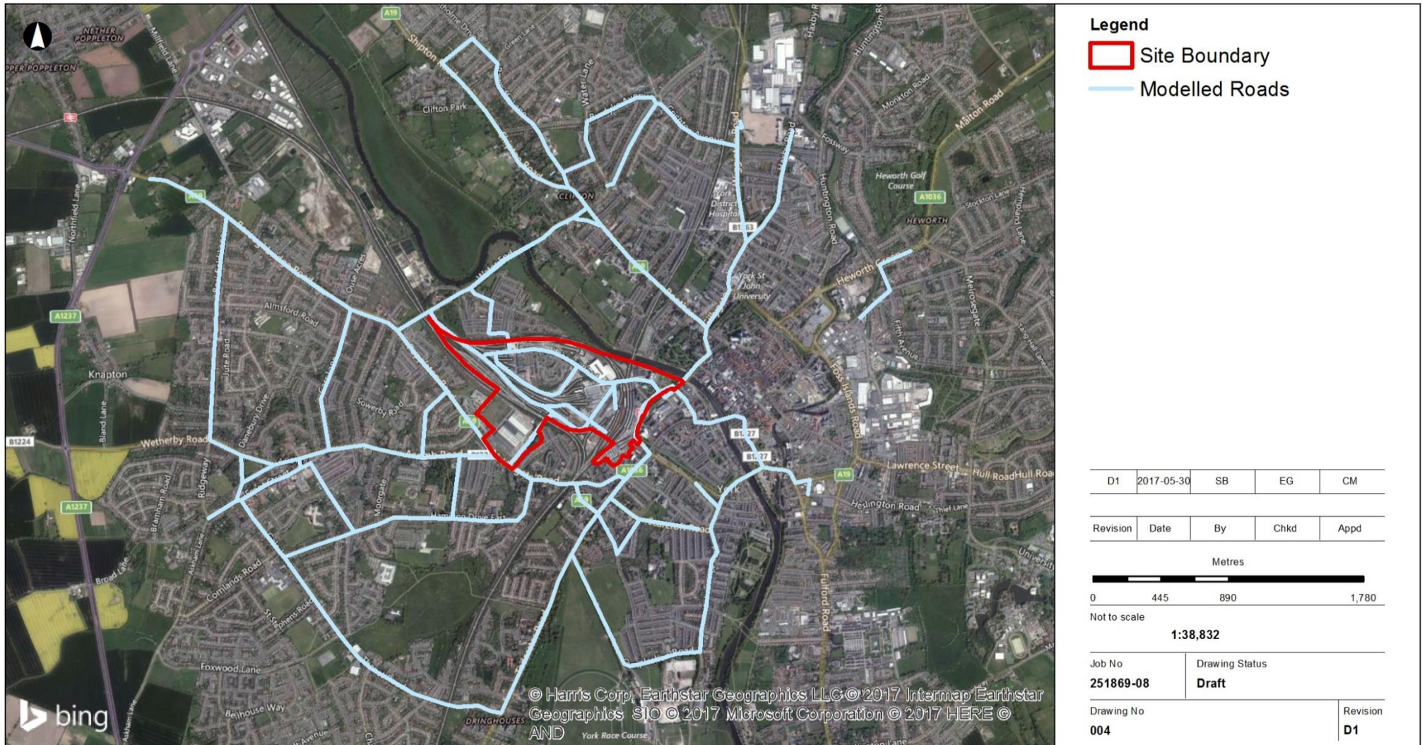
Figure E2: The modelled road network