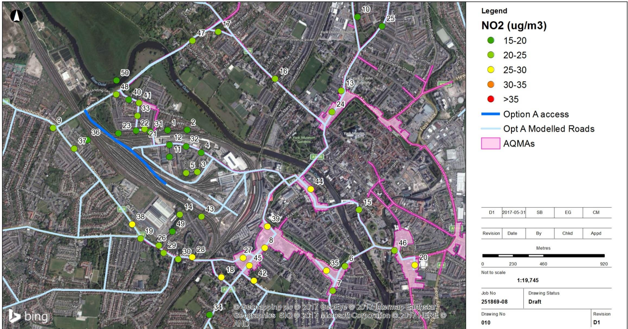
Figure E8: Access Option A, indicative NO 2 concentrations (future Do Something)