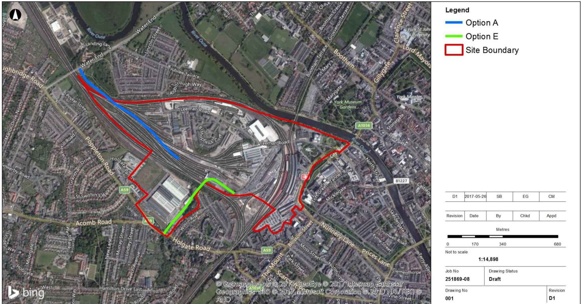
Figure E1: The site boundary for the proposed development at York Central