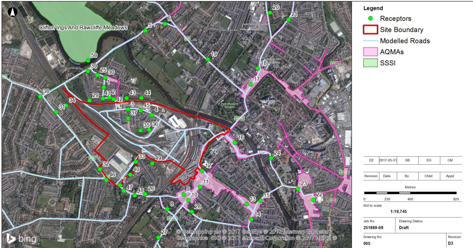
Figure E3: Receptors modelled