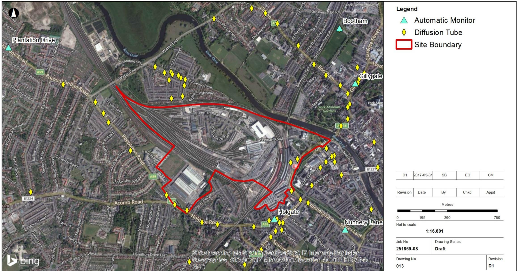
Figure E7: The locations of the automatic monitoring sites and the 85 selected diffusion tube sites within 1km of the site boundary